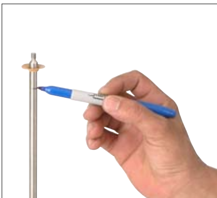
Fig. 3. For final balancing procedure, turn on Motor and lightly hold felt-tip pen about 1 inch (25 mm) from threaded end of Shaft.