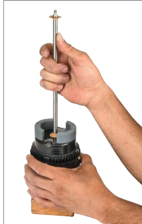
Fig. 2. For rough balancing procedure, put one hand firmly on Motor to stabilize assembly. With other hand, use hand and thumb to push “high” spot on Shaft.