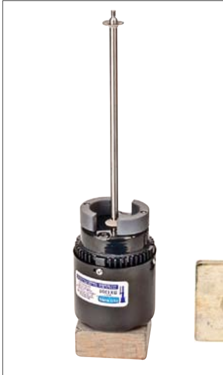
Fig. 1. Position pump on Motor Stand. Then hold Motor firmly with one hand and keep safe distance from Shaft. Turn Motor on briefly to observe Shaft. Caution: Shaft may swing wildly if badly out of balance!

Note: The object of this procedure is to get a continuous (unbroken) pen mark all the way around the Shaft. A continuous pen mark (complete circle) shows that the Shaft is correctly balanced. A partial pen mark (broken circle) shows a “high” spot, indicating the Shaft is out of balance in the direction of the pen mark. The Shaft must be pushed at the “high” spot to balance the Shaft.