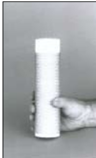
(L-r) Place plastic loading slats over filter. Then slide web over slats and pull down. Remove slats and cartridge is ready to reuse.