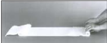
Re-roll blanket around core.